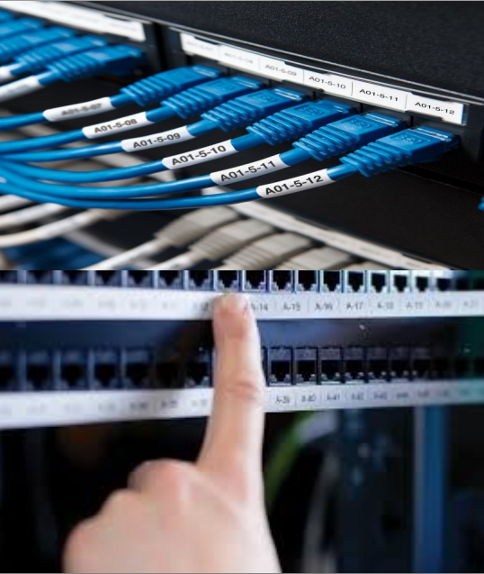
Cable and Wire Identification, Networking Components